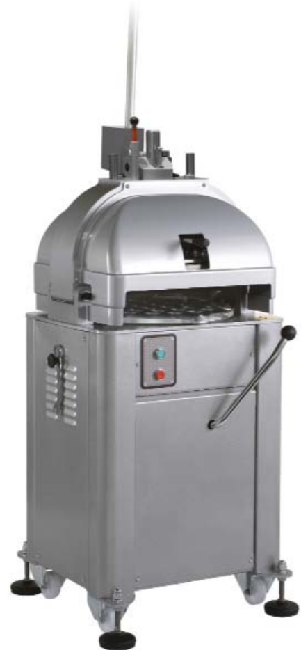
ROUND-A-BOUT IV™ SEMI-AUTOMATIC DIVIDER/ROUNDER Heavy Duty Cast Iron Base Built to Last with Electric-Mechanical Rounding Operation Model UNI-SDR-15-52