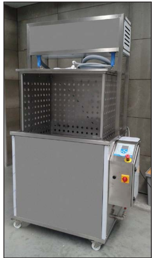
THE UNISOURCE DIP TANK 6000 MOBILE DIP CLEANING SYSTEM

Fully automatic basket moves up & down to load and unload pans easily.