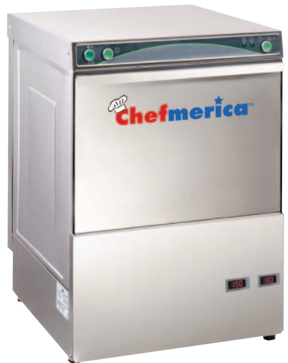
UNI-OBY 500 EUS PLUS