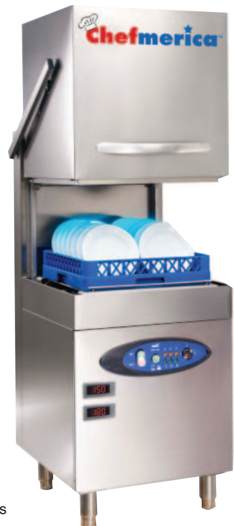
UNI-OBM US PLUS 1080