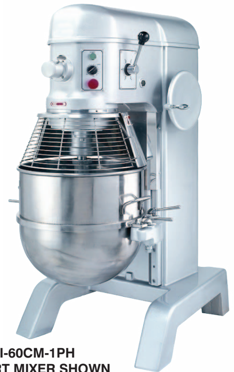
UNI-60CM-1PH 60 QUART MIXER SHOWN

All of the tools are precisely fitted to the bowls. The bowls can be easily removed for cleaning.