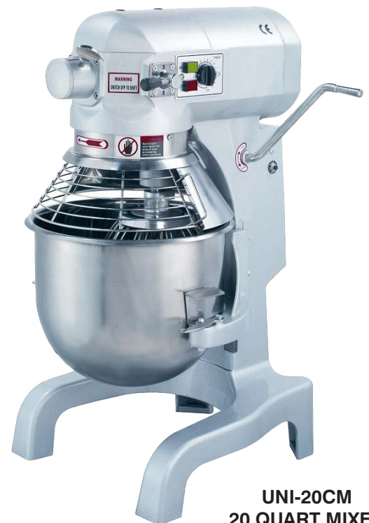
UNI-20CM 20 QUART MIXER

All of the tools are precisely fitted to the bowls. The bowls can be easily removed for cleaning.