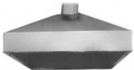
BAGEL KETTLE HOOD