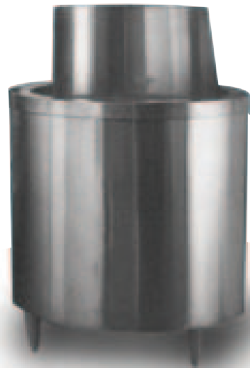
THE UNISOURCE HEAVY DUTY 45 GALLON CAPACITY BAGEL BOILER

For speed, convenience, gas efficiency, and sanitation, there is no comparison. The only fully approved American Gas Association (AGA) and Bakery Sanitation (Bissc) Certified Bagel Kettle available today!