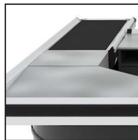
Single Belt Conveyor