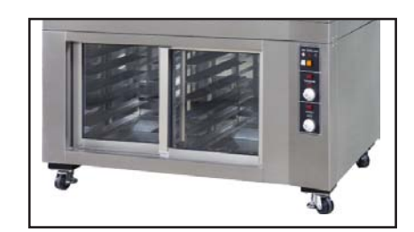
Optional Undercounter Proofer Available UNI-UDOT-PR-4W